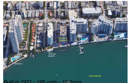
Built in 1971 - 195 units - 15 floors