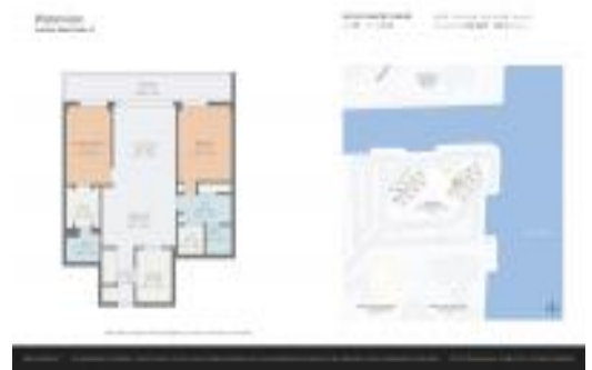
Built in 1981 - 394 units - 23 floors

The above valuated price is a baseline figure that does not take into account any specific renovation, upgrade, split, merge, or deterioration of the unit.