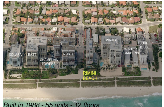
Built in 1988 - 55 units - 12 floors