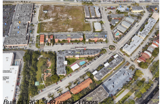
Built in 1963 - 149 units - 3 floors