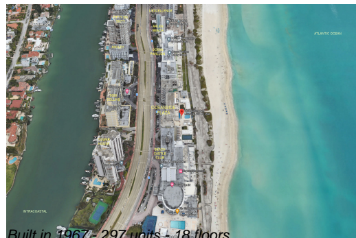
Built in 1967 - 297 units - 18 floors