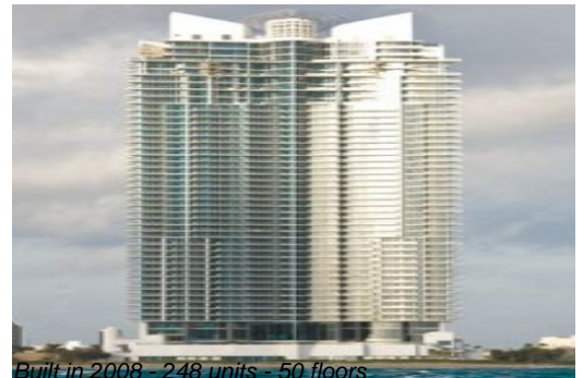
Built in 2008 - 248 units - 50 floors