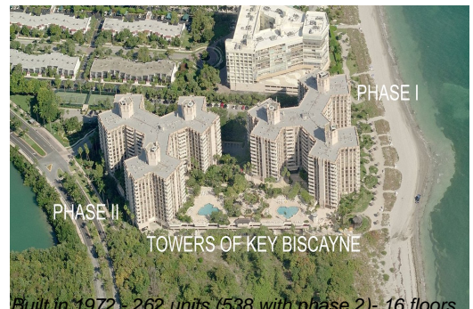
Built in 1972 - 262 units (538 with phase 2)- 16 floors