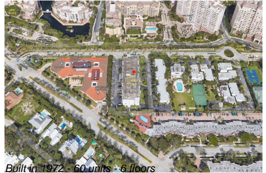
Built in 1972 - 60 units - 6 floors

The above valuated price is a baseline figure that does not take into account any specific renovation, upgrade, split, merge, or deterioration of the unit.