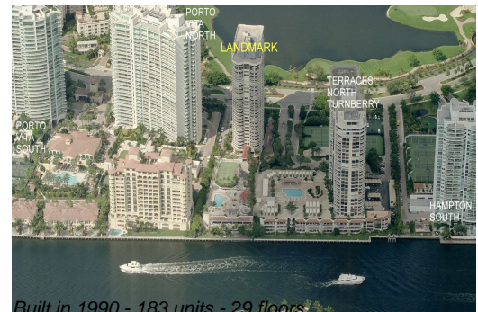
Built in 1990 - 183 units - 29 floors