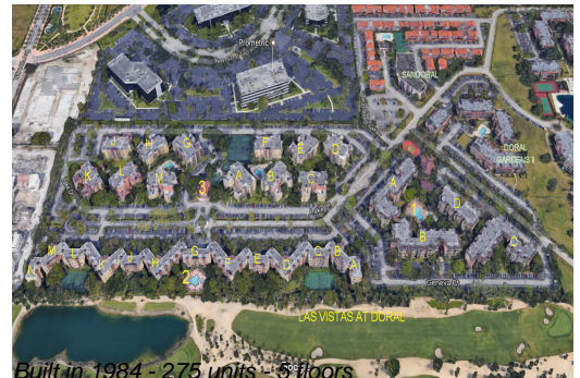
Built in 1984 - 275 units - 5 floors