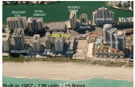
Built in 1967 - 138 units - 15 floors