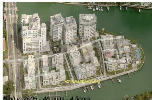
Built in 2005 - 46 units - 4 floors