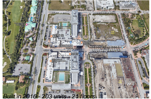
Built in 2016 - 203 units in 21 floors