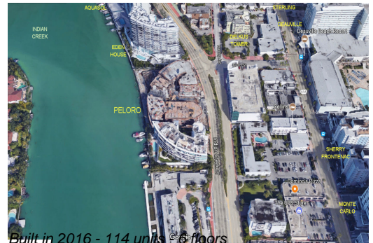
Built in 2016 - 114 units, 16 floors