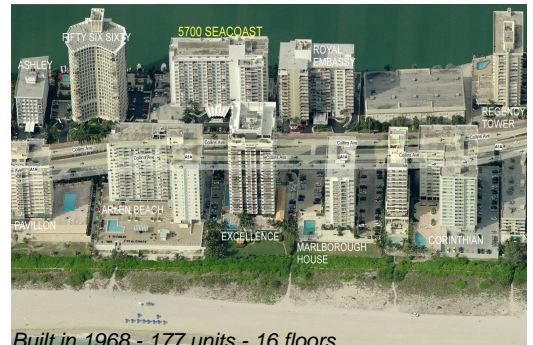
Built in 1968 - 177 units - 16 floors