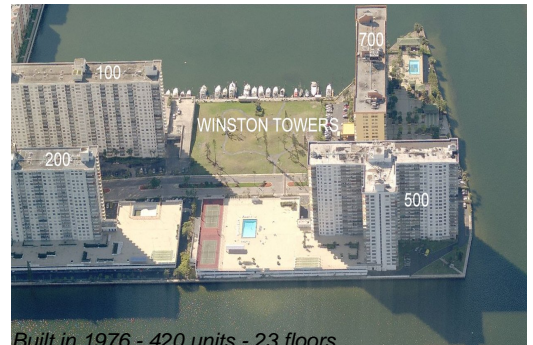
Built in 1976 - 420 units - 23 floors