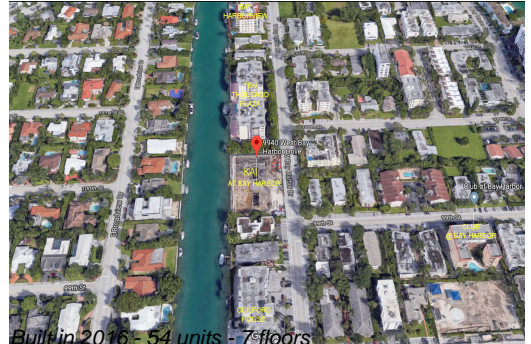
Built in 2016 - 54 units - 7 floors