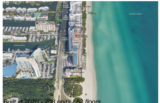
Built in 2020 - 208 units - 52 floors