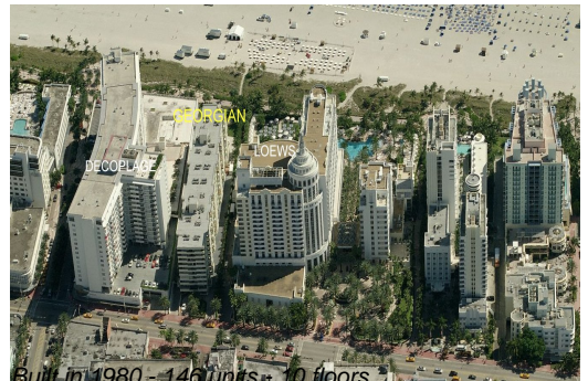
Built in 1980 - 146 units, 10 floors