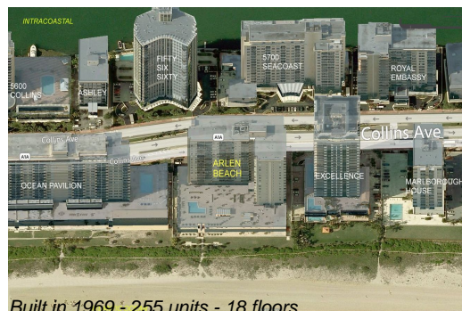
Built in 1969 - 255 units - 18 floors