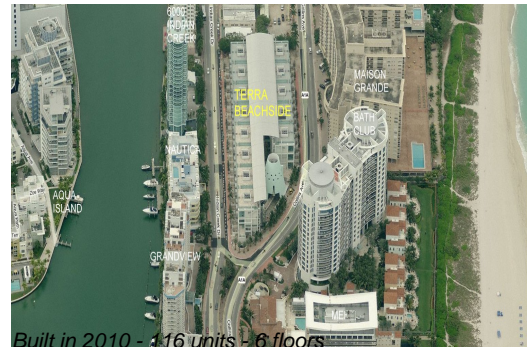
Built in 2010 - 116 units - 6 floors