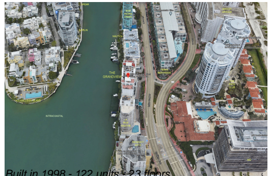
Built in 1998 - 122 units - 23 floors