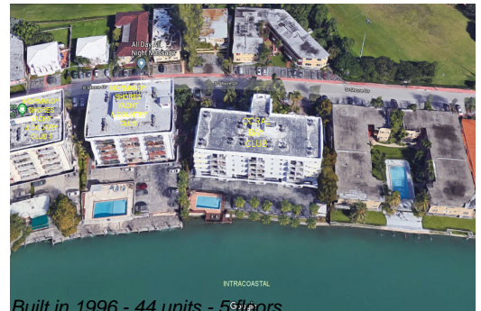
Built in 1996 - 44 units - 5 floors