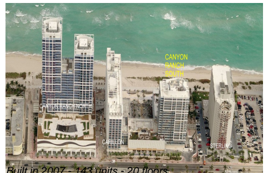
Built in 2007 - 143 units - 20 floors