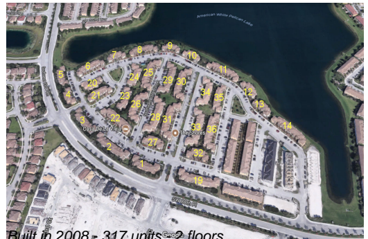
Built in 2008 = 317 units = 2 floors