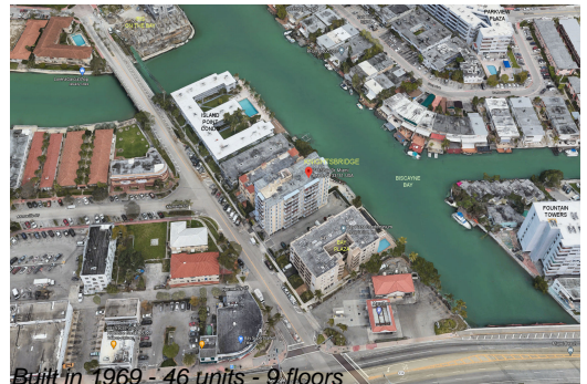
Built in 1969 - 46 units - 9 floors