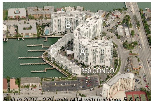
Built in 2007 - 279 units (414 with buildings B & C) - 15 floors