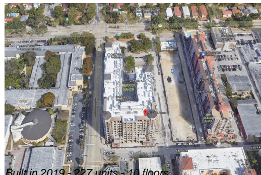
Built in 2019 - 227 units - 10 floors