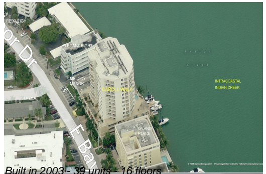
Built in 2003 - 39 units - 16 floors