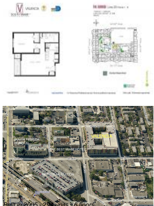
Built in 2005 - 294 units - 6 floors.