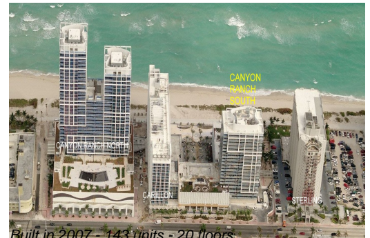
Built in 2007 - 143 units - 20 floors