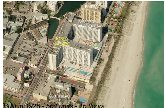
Built in: 1926 - 564 units - 16 floors