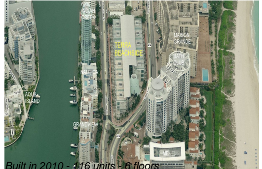
Built in 2010 - 116 units - 6 floors