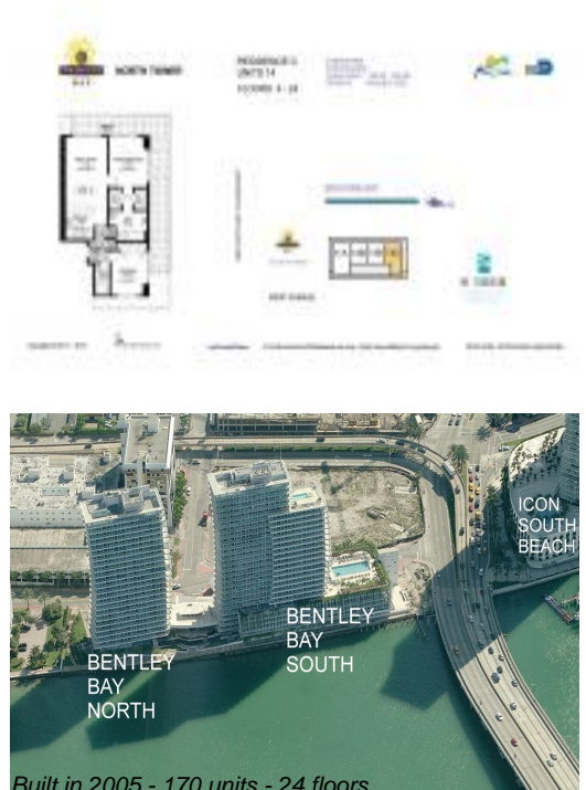
Built in 2005 - 170 units - 24 floors