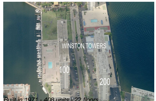
Built in 1971 - 408 units - 22 floors