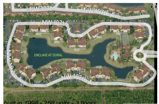
built in 1998 - 258 units - 3 floors

Enclave at Doral: 61 days Doral: 61 days Miami-Dade: 77 days