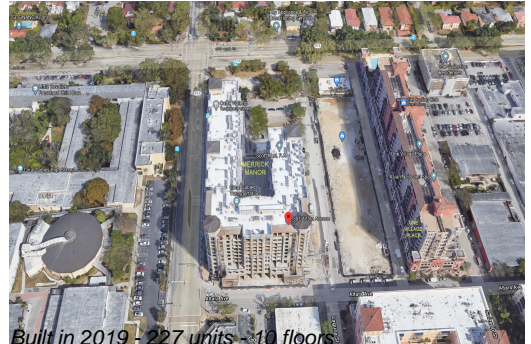
Built in 2019 - 227 units - 10 floors