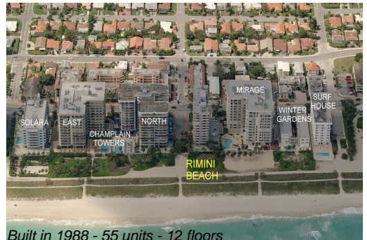
Built in 1988 - 55 units - 12 floors