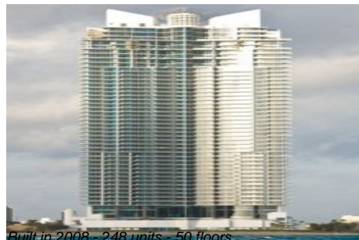
Built in 2008 - 248 units - 50 floors