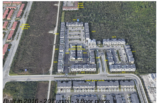
Built in 2016 - 201 units - 3-floor plans