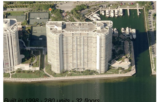
Built in 1998 - 280 units - 32 floors