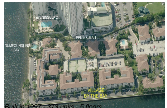
Built in 1997 - 373 units - 5 floors