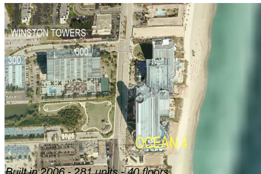
Built in 2006 - 281 units - 40 floors