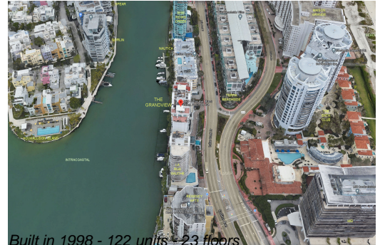
Built in 1998 - 122 units - 23 floors