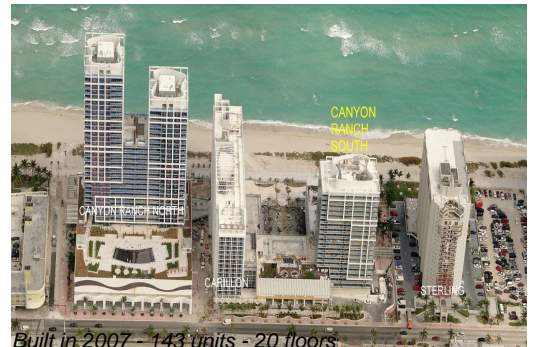
Built in 2007 - 143 units - 20 floors