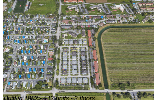
Built in 1982 - 112 units - 2 floors