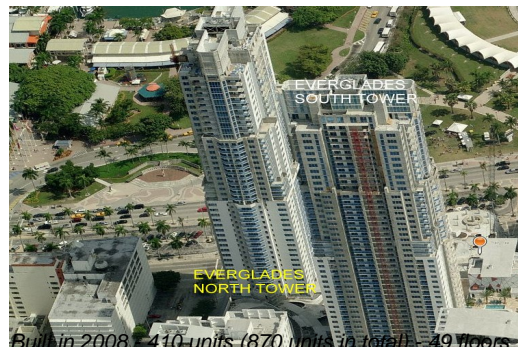
Built in 2008 - 410 units (870 units in total) - 49 floors