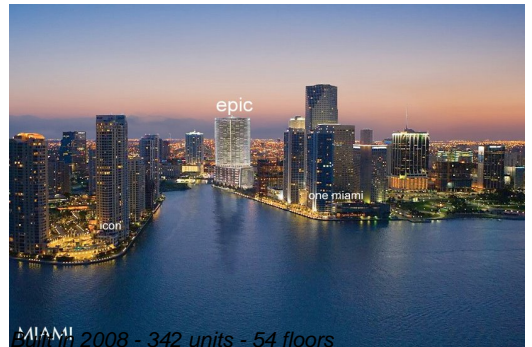
MIAMI: 2008 - 342 units - 54 floors