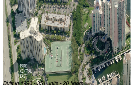
Built in 1990 - 351 units - 20 floors

The above valuated price is a baseline figure that does not take into account any specific renovation, upgrade, split, merge, or deterioration of the unit.