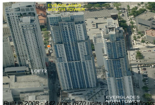
Built in 2008 - 442 units (870 units in total) - 45 floors